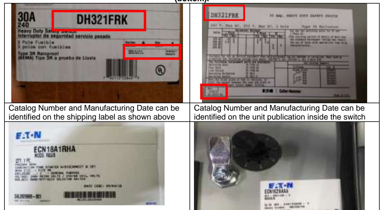
Figure 1. Location of catalog number and date code for safety switches (top) and enclosed control (bottom).

If you are not the end customer for this product and you have subsequently shipped this product to a third-party, please forward this notice to the end customer/third-party. Electronic copies of this notice that may be downloaded and forwarded are available at <a href="http://eatoncanada.ca/hdss-advisorybulletin">http://eatoncanada.ca/hdss-advisorybulletin</a>.